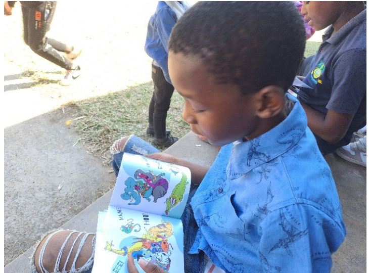
Happiness is ... Holding & Reading your very own books!