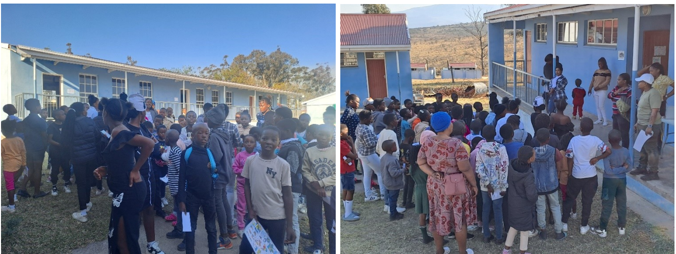
Literacy enthusiasts arriving at the TVS Learning Centre

Local educational professionals were on hand to support and encourage literacy throughout the day, making the event a memorable success.