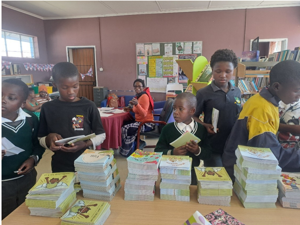
12 Titles to select books from, in two languages as well as a wordless, story book