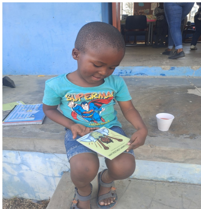
Many thanks to Book Dash, SOLON & TVS, for making this day possible.